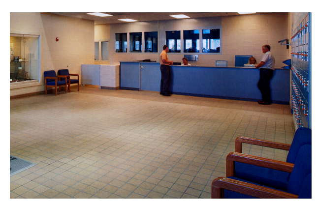
Entrance at Jefferson City Correctional Center

Please contact the Office of Victim Services if you want to attend a parole hearing. Parole hearings can occur in two different venues: at the institution or via videoconference at Probation and Parole Central Office in Jefferson City, Missouri. If you choose to attend a hearing, contact the staff at the Office of Victim Services to arrange your attendance. You will have to travel to the institution or Probation and Parole Central Office at your own expense. Directions to the hearing site will be provided, or you can visit at doc.mo.gov for directions to institutions and the Probation and Parole Central Office.