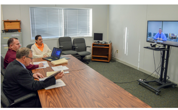
Video parole hearing in Jefferson City, Mo.

Security measures limit what you may bring. Please present a photo ID (e.g. driver's license). You will enter a DOC facility and may be subject to a security search by staff. If you require special accommodations, please let us know in advance.